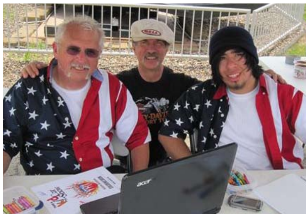
Fast Lane Classic Cars– May, 2010