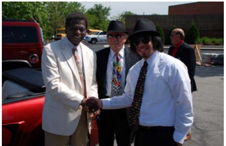
Baseball Hall of Famer, Lou Brock, Florissant Valley of Flowers Parade- May, 2010