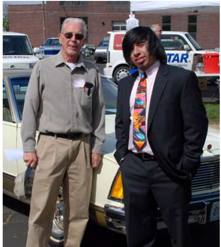
Ranken Technical College Car Show- April, 2010